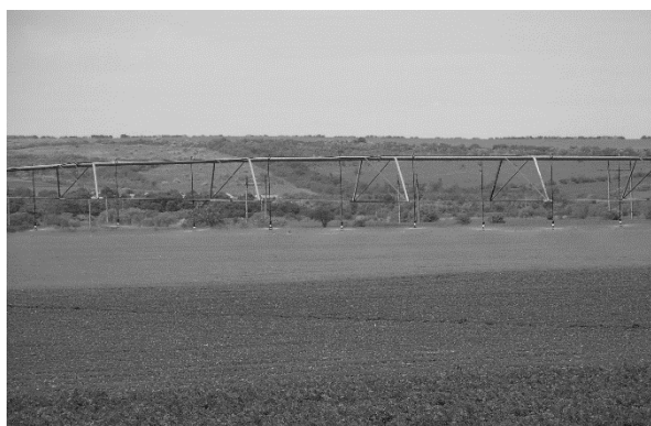
Fig. 1 - Installation used for the irrigation of dried alluvial soils

In the basis of landscape methods lies the comparative-geographical approach, the condition of which is the obligatory presence of a topographic map characterizing the relief - the main factor in the differentiation of the soil cover. Therefore, one of the simplest and at the same time effective research methods is the geomorphological soil profile bookmarking method [5].