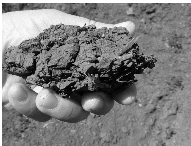
Fig. 4. The natural structure of the alluvial soils

Physical indices. The density of the investigated soils profile varies from 2.65 \pm 0.14 in the arable horizon to 2.75 \pm 0.13 in the Bbhgk horizon. The accuracy of determining the average indices varies within the limits of 1.86-3.03%, the coefficient of variation of the density in space does not exceed 6.1%. The apparent density in the profile of irrigated alluvisolts varies from 1.23 \pm 0.14 g/cm 3 in the arable layer, to 1.44 \pm 0.08 g/cm 3 in the underlying layers. The arable layer is characterized by optimal apparent density values, but the underlying arable layer is very compacted (Fig. 4).