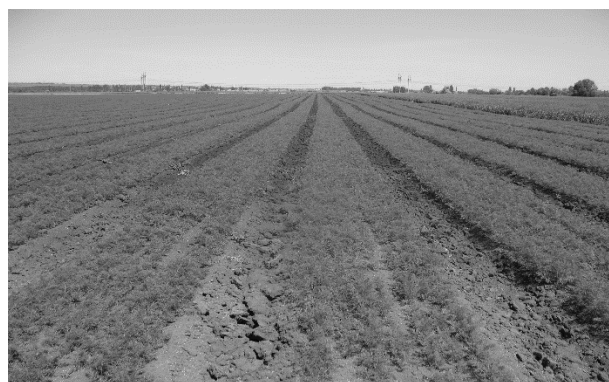
Fig. 2 - The use of soils in the Lower Dniester meadow

The profile of alluvial soils (Fig. 3). The composition of the studied irrigated alluvial soils profile is characterized by the following type: Ahp1 (0-20 cm) → Ahp2 (20-38 cm) → ABh (38-57 cm) → Bhg (57-80 cm) → Abhg (80- 95 cm) → Bbhgk (95-115 cm) → Gk1 (115-135 cm) → G2 (135-160 cm) → G3 (160-200 cm).